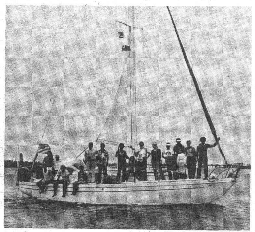
OCEAN BLUE — YOU members and chaperons from Tonga sail to the island of Pangaimotu July 28. Most had not been in a boat before. [Photo