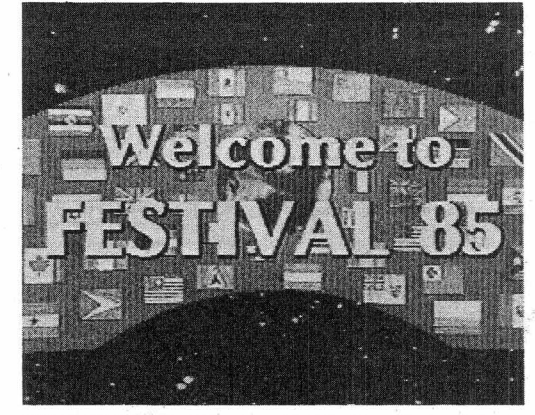
FEAST PRODUCTION — The above television logo will precede Pastor General Herbert W. Armstrong's opening night message Sept. 29. The above print was taken directly from the original videotape using a video

Singing in harmony with children from Imperial Schools in Pasadena, the Chinese children showed that peace among people of different nations and cultures is possible when the way of hatred and