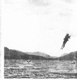
LOCH LOMOND, SCOTLAND