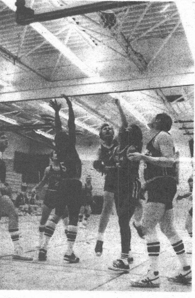
BASKETBALL TOURNAMENT — Left: The Cleveland, Ohio, cheerleaders, the Mamas, perform. Right: The Cleveland team battles the Pittsburgh, Pa., players. (See "Sports," page 5.)

us donated items were sold at har gain prices or won with a raffle ticket. After the games, thousands of little tastebuds enjoyed a spaghetti dinner and all those present sat back and enjoyed the