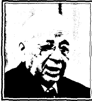
HERBERT W. ARMSTRONG

If ever a President needed the help of this great people he leads, it is now. Some are asking, can you turn the United States around? They look to problems of inflation, unemployment, energy, taxes, budget, business, defense. But those are materialistic problems. In the materialistic area we have fared better than we realize. This nation has