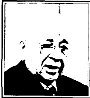
HERBERT W. ARMSTRONG

not look deeply enough to see. There are, basically, only the two broad ways of life. They travel in opposite directions. I state them very simply. The one is LOVE, meaning outflowing concern for the good of others, cooperation, serving, sharing. I term it "GIVE." The opposite way to which this world is drawn is "GET."